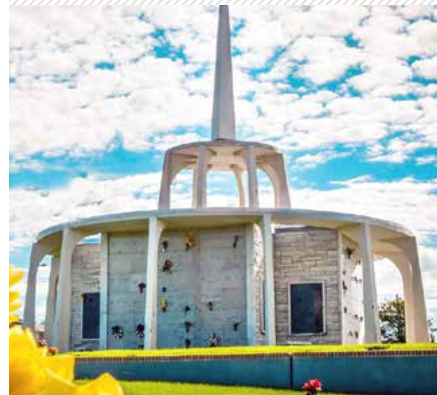
Mausoleum at Memorial Gardens Funeral Home and Memorial Gardens Cemetery

ANSWER: Your instincts are good. What your competitor has suggested is illegal. Our businesses are subject to laws that prohibit the restraint of competition, including price fixing, which inhibits consumer’s ability to select the provider of their choice. You should follow up with your competitor making it clear that the suggested arrangement is inappropriate.